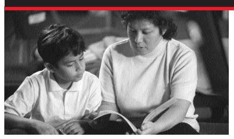
Los niños deben conocer los números de teléfono y direcciones de correo electrónico de las personas de la familia. Deben llevar esta información con ellos a la escuela y deben poder hallarla fácilmente en el hogar.