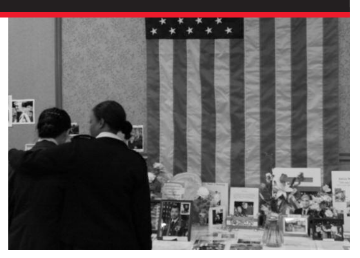
En el Centro de Asistencia Familiar de la Cruz Roja Americana cerca del Pentágono, una trabajadora voluntaria de la Cruz Roja consuela a una familiar de una persona fallecida a causa del ataque.

Usted necesita saber si los niños se quedarán en la escuela hasta que uno de los padres o un adulto que usted nombre los recoja o si la escuela los enviará de regreso al hogar por su cuenta. Asegúrese de que el personal de la escuela tenga información actualizada para comunicarse con los padres y las personas que cuidan de los niños para que pueda hacer arreglos para recoger a los niños. Pregunte a la escuela qué tipo de autorización o permiso hace falta para