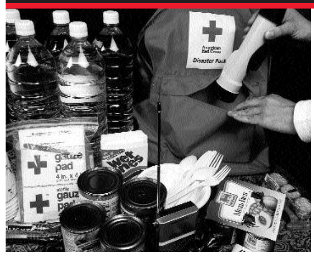
Un equipo de suministros para emergencias, con artículos como los que se muestran y una radio y pilas de repuesto, es esencial en caso de emergencia.